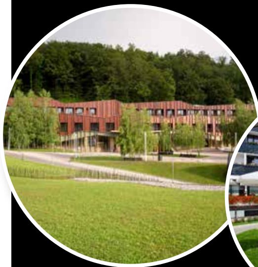
Wellness Hotel Sotelia****s